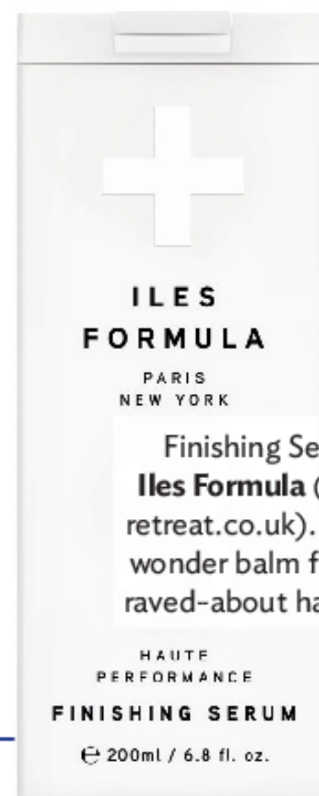
Finishing Serum, £38, Iles Formula (shop.urbanretreat.co.uk). A protective wonder balm from the new raved-about haircare range.