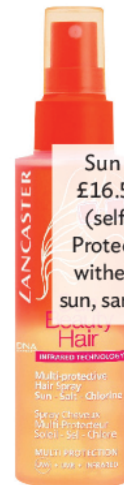
Sun Beauty Hair, £16.50, Lancaster (selfridges.com). Protects against the withering effects of sun, sand and chlorine.