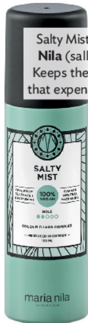
Salty Mist, £18.98, Maria Nila (sallyexpress.com). Keeps the sun from fading that expensive salon colour.