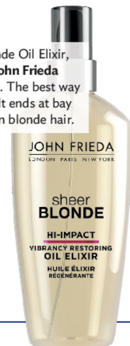
Sheer Blonde Oil Elixir, £9.99, John Frieda (boots.com). The best way to keep spilt ends at bay and brighten blonde hair.