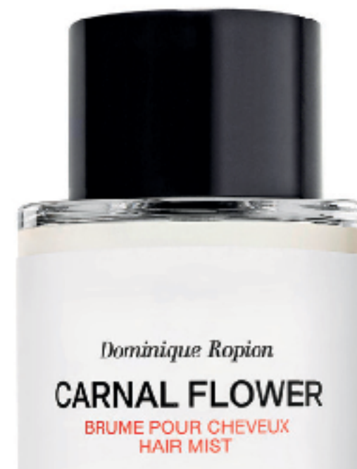
Carnal Flower Hair Mist, £110, Frederic Malle (fredericmalle.com). A tuberose-scented hair spritz for sun worshippers bored of smelling like a coconut.