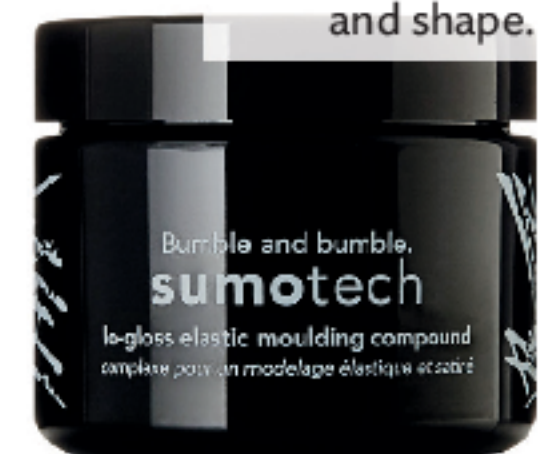
Sumotech, £22, Bumble and bumble (feelunique.com). The ultimate styling secret to add texture and shape.