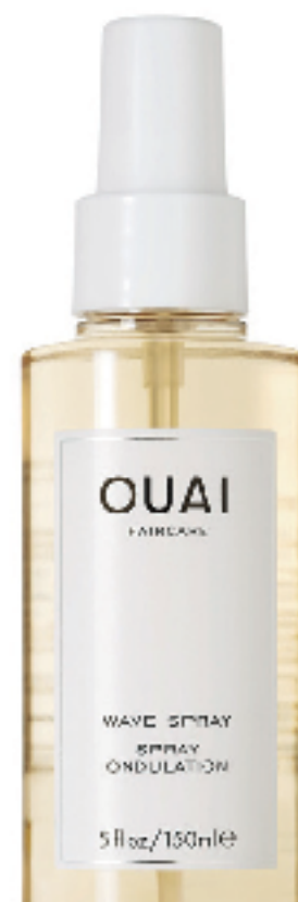
Wave Spray, £22, Ouai Haircare (net-a-porter.com). This spray gives hair scrunchable waves.