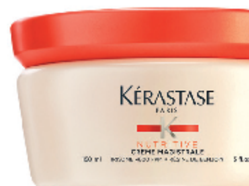
Nutrive crème magistrale, £29, Kérastase (kerastase.co.uk). Leave in towel-dried hair for extra softness and shine.