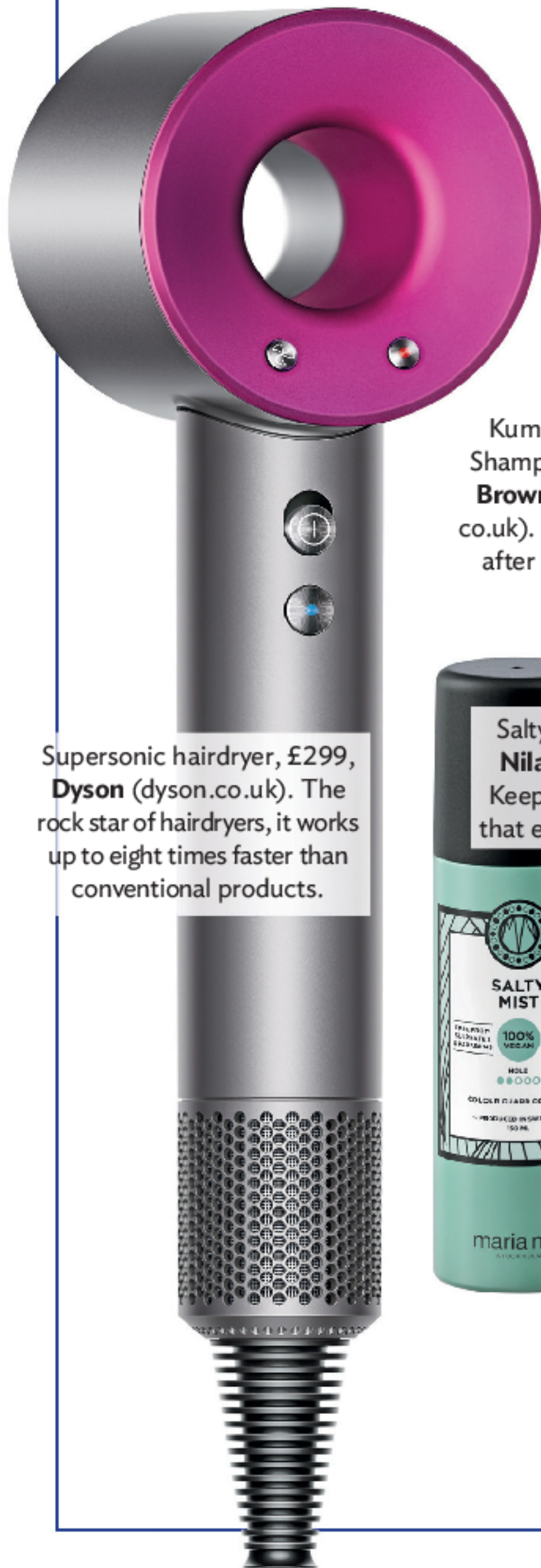
Supersonic hairdryer, £299, Dyson (dyson.co.uk). The rock star of hairdryers, it works up to eight times faster than conventional products.